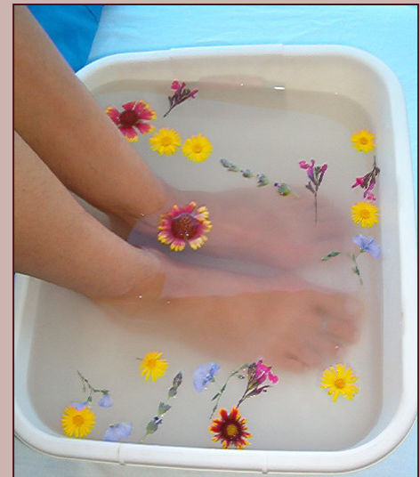
Solutare Per Aqua HEALTH THROUGH WATER

At ASIS, therapeutic applications of heat and cold, ice packs, bodywraps, Kneip therapies, whirlpools, flower essences, essential oils, and other therapeutic tools and procedures are discussed or practiced in the school setting. Students learn how to incorporate these tools in their massage practice, for hydrotherapy was the first medicine, to influence modern techniques used by naturopaths, physical therapists, massage therapists, orthopedic physicians and spas.